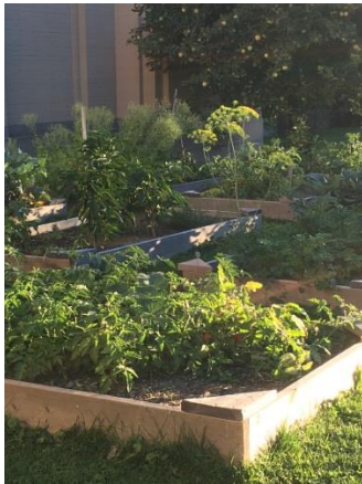
3 rd grade vegetable garden